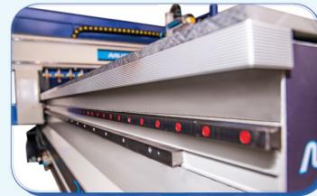
CPC LİNEER RAYLAR VE ARABALAR CPC LINEAR SLIDES AND GUIDEWAYS