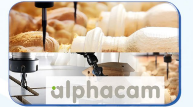
OPSİYONEL CAD & CAM PROGRAMI OPTIONAL CAD & CAM PROGRAMI

MAĞAZA / SHOWROOM Önder Mah. Ereğli Cad. No: 11 Siteler / Altındağ / ANKARA / TURKEY Tel: +90 312 349 68 68 - 69 Fax: +90 312 351 80 80