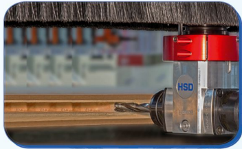
OPSİYONEL YATAY DELİK OPTIONAL HORIZONTAL MOTOR