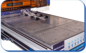
ALÜMİNYUM TABLA ALUMINIUM TABLE