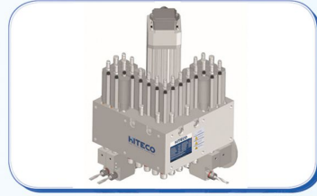
OPSİYONEL DELİK GRUBU OPTIONAL BORING GROUP