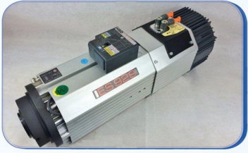
9 Kw HSD İŞ MİLİ 9 Kw HSD SPINDLE