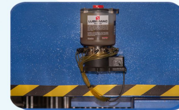
OTOMATİK YAĞLAMA AUTOMATIC LUBRICATION